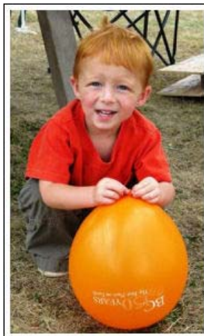
Cedar Farmers' Market

On Sept. 27 the Ladner Village Market will host a BC150 Moonlight Market that will honour the Fraser River. This one-night-only market will light up the street and bring back encore performances from favourite vendors and entertainers.